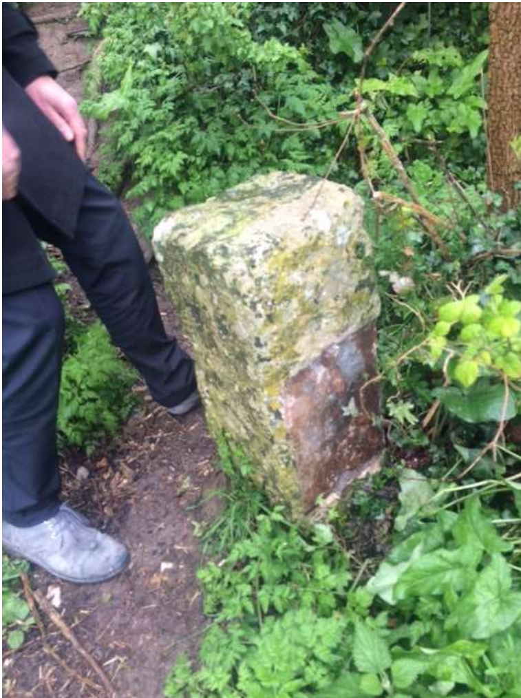
How the Boundary Stone looks at present