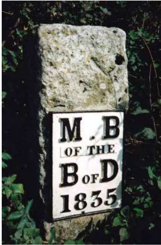
How the Boundary Stone should look