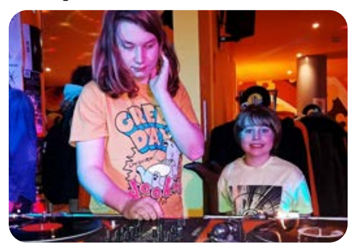
£500 to C Side for its Express Yourself project (pictured) offering creative music workshops for young people.

Over recent months the Town Council's Management Committee has awarded more small grants to help a variety of community projects, including: