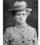
Elsie Inglis Edinburgh