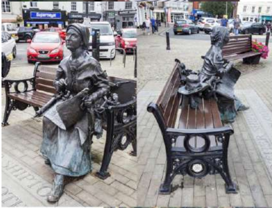
MOTHER SHIPTON KNARESBOROUGH