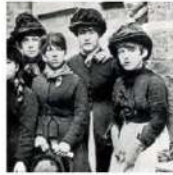
Match Girls East End