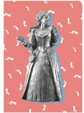
Aphra Benn - Canterbury