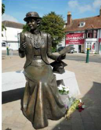
EMILY DAVISON EPSOM MARKET PLACE