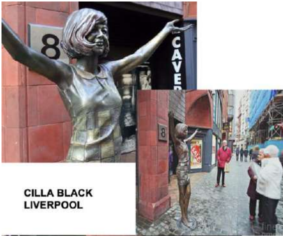
CILLA BLACK LIVERPOOL