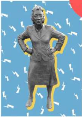
Henrietta Lacks - Bristol