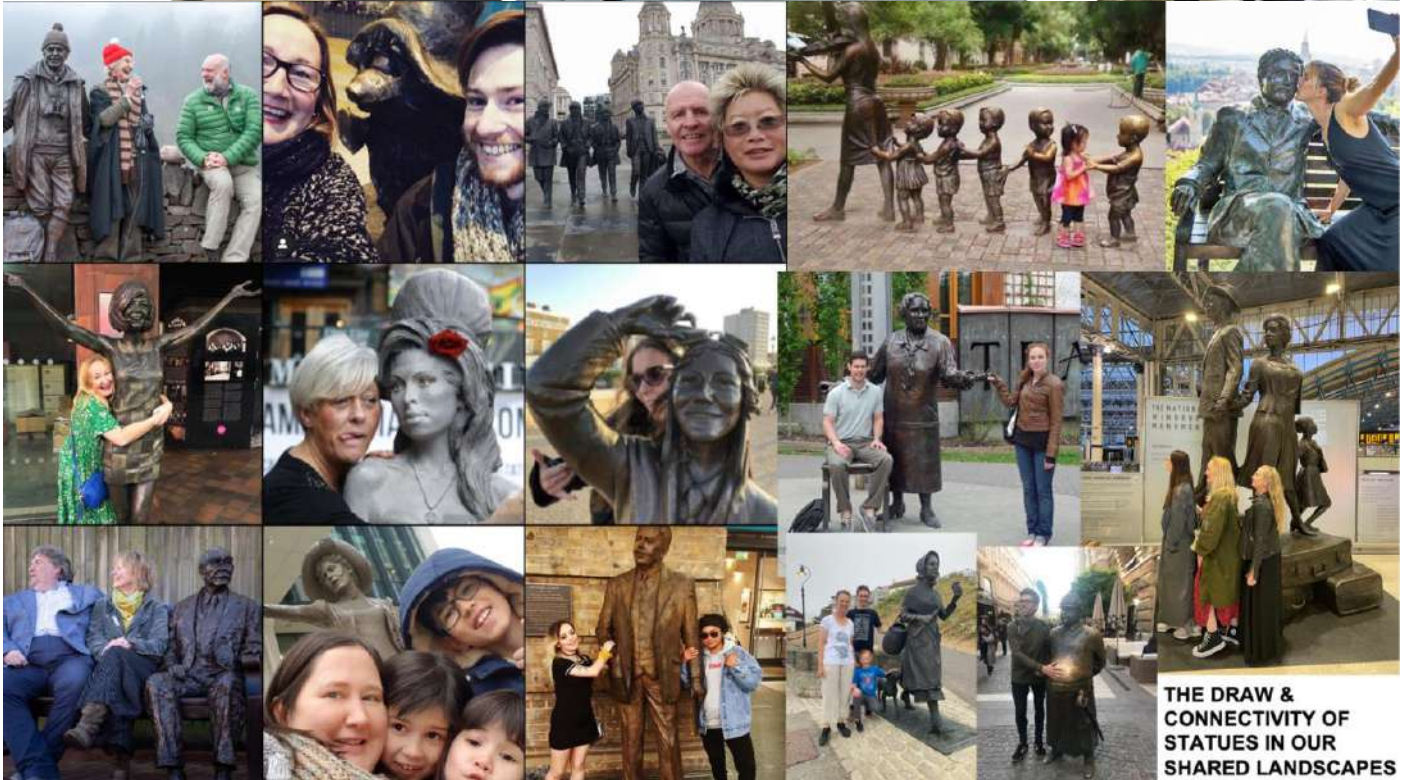
THE DRAW & CONNECTIVITY OF STATUES IN OUR SHARED LANDSCAPES