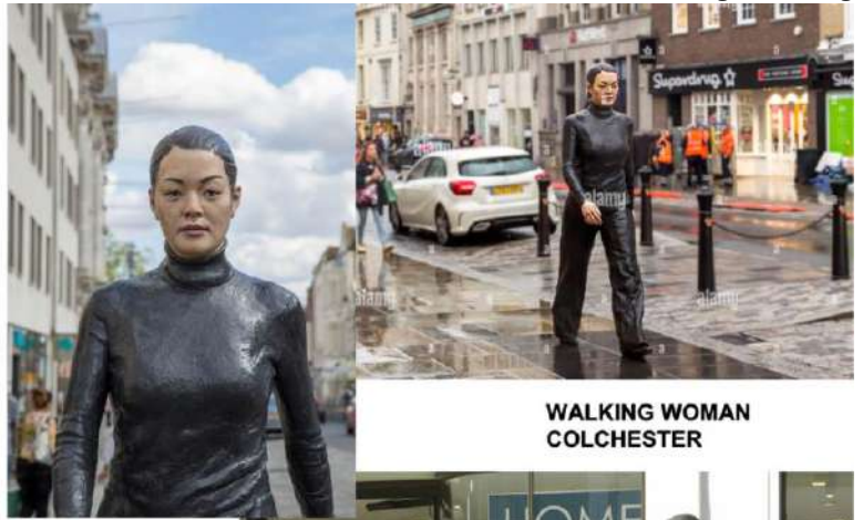
WALKING WOMAN COLCHESTER