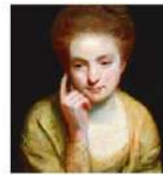
Mary Astell Newcastle