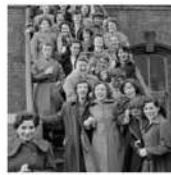
The Factory Girls Derry