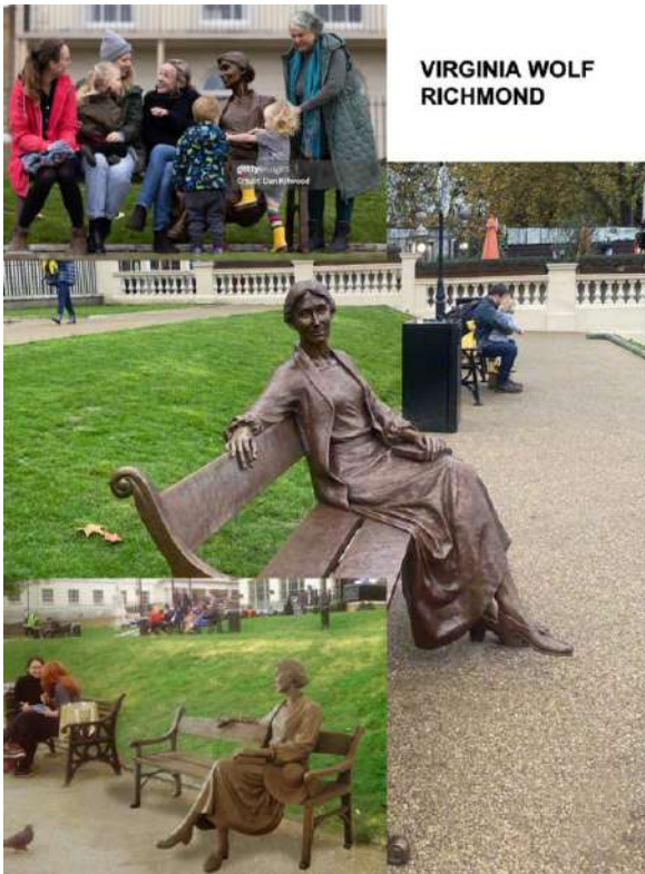
VIRGINIA WOLF RICHMOND

Showcasing ground-level interactive works of art in high footfall and central high-street locations